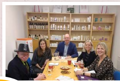
Top: The Ultrasun UK team.