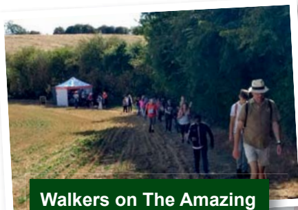
Walkers on The Amazing Grace Pilgrimage.