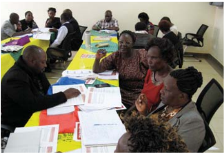
Top: Kenya Institute of Special Education. Below: Teachers and pupils.